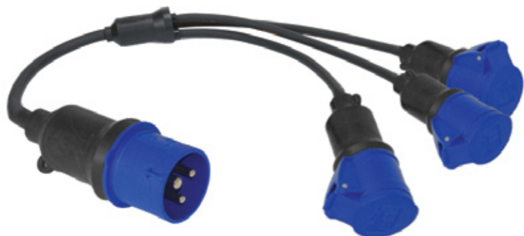
32 Amp - 1ph to 3 x 32A 1ph