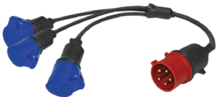
32 Amp - 3ph to 3 x 32A 1ph

PowerFLEX Y-Splitters are made with heavy duty H07RN-F flexible cable