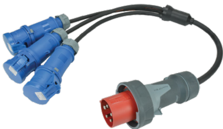
32 Amp - 3ph to 3 x 32A 1ph

PowerFLEX Y-Splitters are made with heavy duty H07RN-F flexible cable