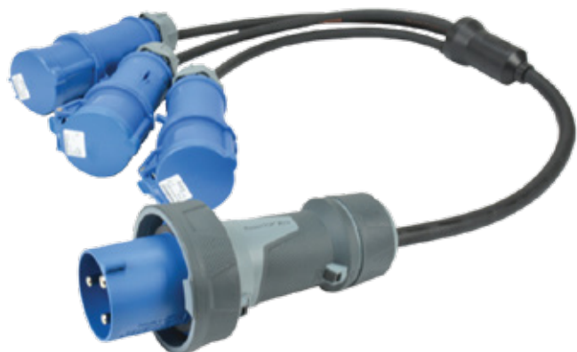
32 Amp - 1ph to 3 x 32A 1ph