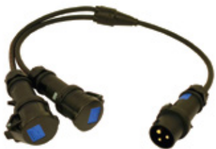
16 Amp C - FORM - BLUE