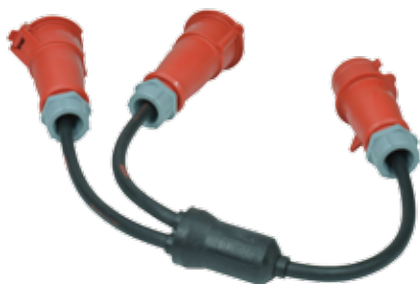
32 / 63 Amp C - FORM - RED

PowerFLEX Y-Splitters are made with heavy duty H07RN-F flexible cable