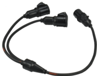
16 Amp CEE Overmould - BLACK