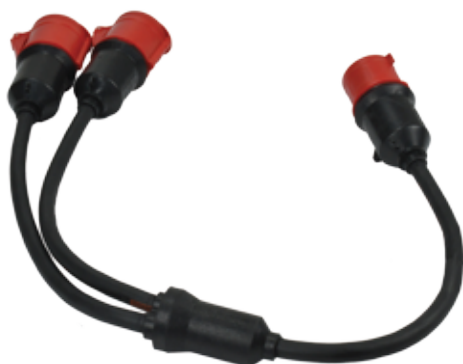
32 Amp CEE Overmould - RED